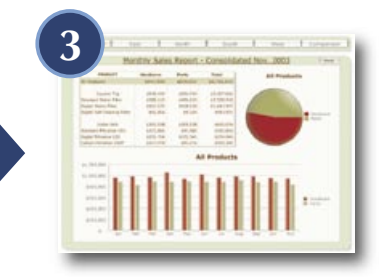
Import an existing Excel spreadsheet or XML data source.