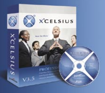
Xcelsius Professional 3.5

Create visually stunning and interactive data-presentations for your MS Office applications. Single-user license.