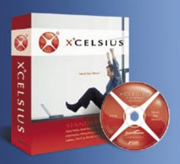
Xcelsius Standard 3.0

Create visually stunning and interactive data-presentations for your MS Office applications. Single-user license.