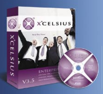
Xcelsius Enterprise 3.5

Develop dashboards and advanced real-time models using XML data sources. Developer license.